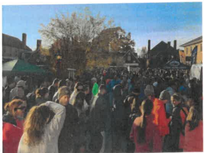
2019 Race goers heading to the starting line.